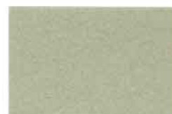
★ ■ CHAMPAGNE