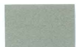
★ ■ PREWEATHERED GALVALUME®