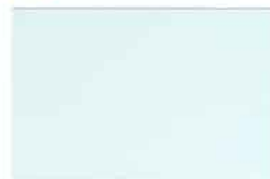
★ ■ SHASTA WHITE