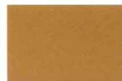
★ ■ COPPER-COTE™