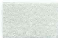
★ ■ SATIN FINISH GALVALUME®

Berridge Satin Finish Galvalume® is pretreated to remove mill oils, chemicals and residue and coated on the back side to inhibit corrosion. The top side receives a clear plastic strippable film.