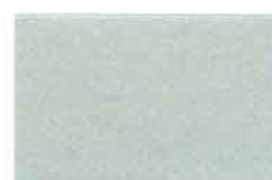
★ ■ ZINC-COTE™